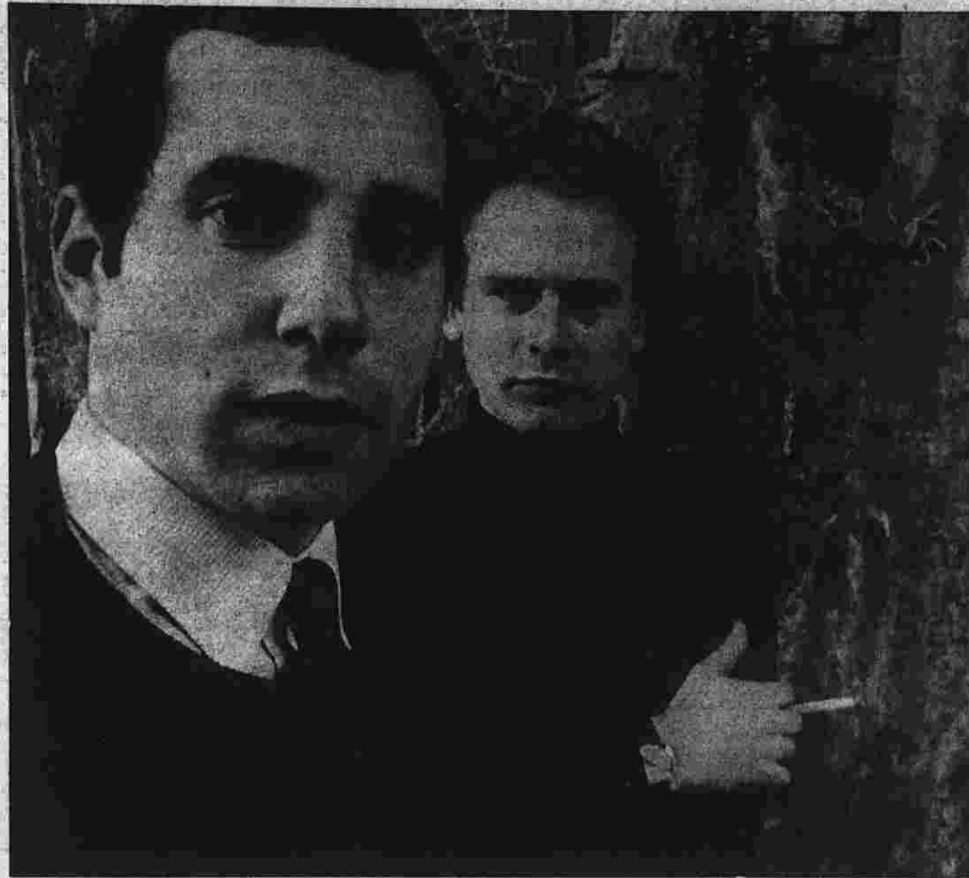
Simon and Garfunkel, the popular and controversial folk-rock singers, will make a rare television

David Janssen has given a sustained and convincing performance through all the seasons of ABC's "The Fugitive." Lucille Ball still is the top comedienne of the television world, and Brian Keith of CBS's "Facily Affair" handles him-