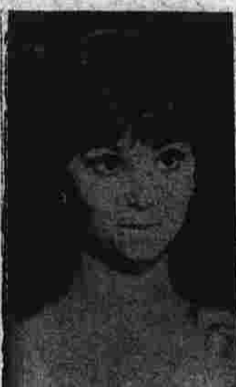
Marlo Thomas stars in ABC's "That Girl," Thursdays 9:30 - 10 p.m.